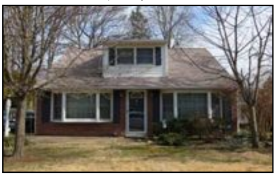
1013 Chesterfield Road Barrington/Tavistock Hills $186,900