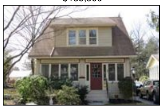
222 1st Avenue Haddon Heights $299,900