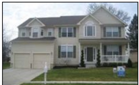
6 Ashley Court Barrington/Hidden Ponds $389,900