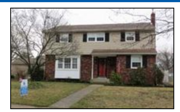
200 Madison Avenue Barrington/Gardens $274,900

137 Russell Avenue Barrington/Gardens $139,500