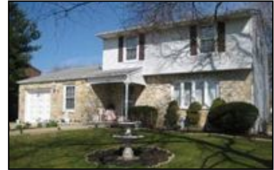
593 Sherrington Lane Runnemede $199,900