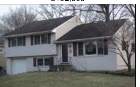
1200 Oakwood Road Barrington/Tavistock Hills $189,900