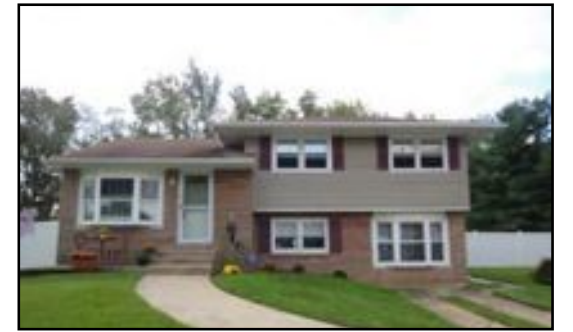
251 Lott Avenue Barrington/Gardens $186,000