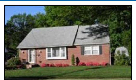
1016 Chesterfield Road Barrington/Tavistock Hills $248,000