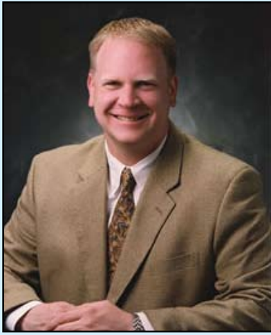
Mayor John D. Rink

The spring and summer have been extremely difficult in regards to following-up on various properties with overgrown grass and landscaping. The number of property complaints has exceeded any previous counts, as a result of various financial hardships. To date there have been 69 property maintenance complaints for the year, with 67 complaints having been closed. Due to various hardships, Public Works has been cutting the grass at 11 properties in town and there are at least 15 properties that banks are maintaining. Sometimes it will seem to take a long period of time in order for a particular property to be addressed. By law, we need to notify the property owner of the violation prior to the Borough being able to address. It is difficult at times to track down the own-