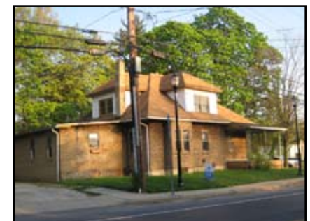
1 E. Gloucester Pike Barrington $98,000