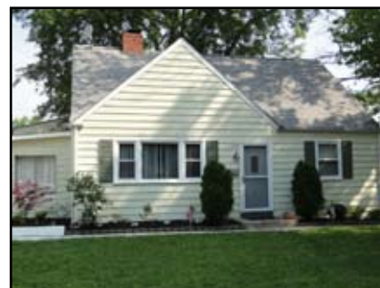
143 Moore Avenue Barrington/Gardens $175,000