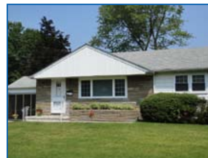
155 Russell Avenue Barrington/Gardens $149,000