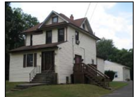
228 Shreve Avenue Barrington/Triplex $279,000