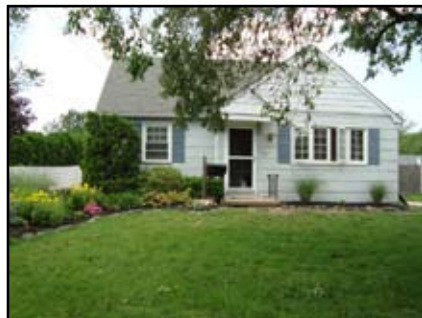
217 Adams Avenue Barrington/Gardens $179,000