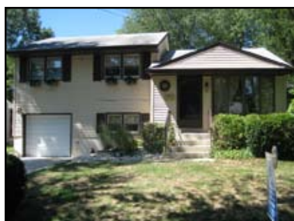
5 Beaver Drive Barrington/Stonybrook $159,900