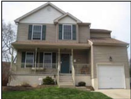
111 Trenton Avenue Barrington $239,900

PRUDENTIAL FOX & ROACH'S LEADING AGENT FOR SALES UNIT IN 2010