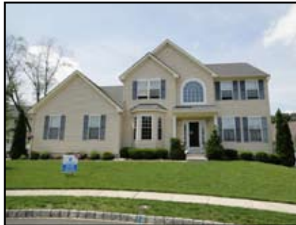
5 Ashley Court Barrington/Hidden Ponds $374,900