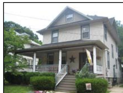
226 Chestnut Street Audubon $299,900