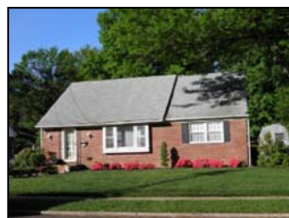
1016 Chesterfield Road Barrington/Tavistock Hills $248,900