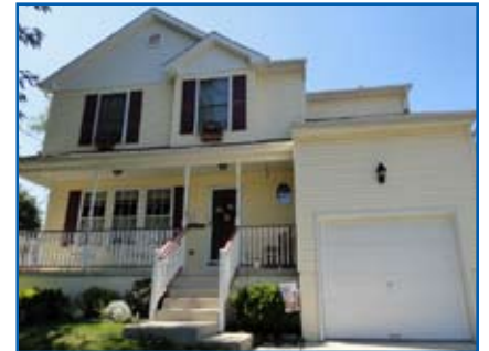
113 Trenton Avenue Barrington $249,900