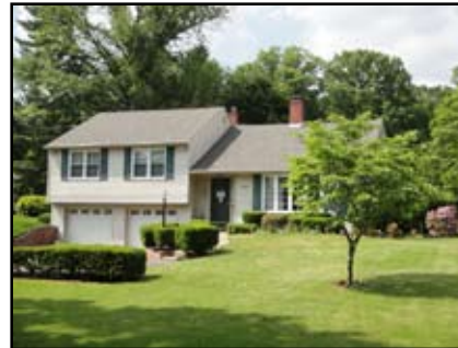
333 Hutchinson Avenue Barrington/Tavistock Hills $449,000