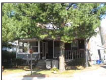
37 E. Gloucester Pike Barrington/Duplex $130,000