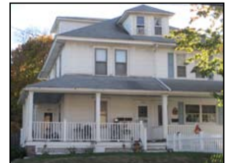
412 Clements Bridge Road Barrington/Duplex $149,900