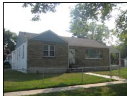
142 Kingston Avenue Barrington/Gardens $196,900