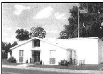
Barrington Post 7247 Veterans of Foreign Wars 109 Shreve Avenue Barrington, NJ 08007-1501