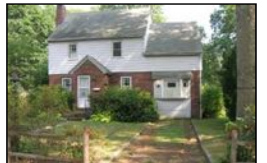
446 Hobart Drive Barrington/Tavistock Hills $215,000