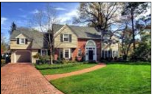
651 Clinton Avenue Haddonfield $949,000