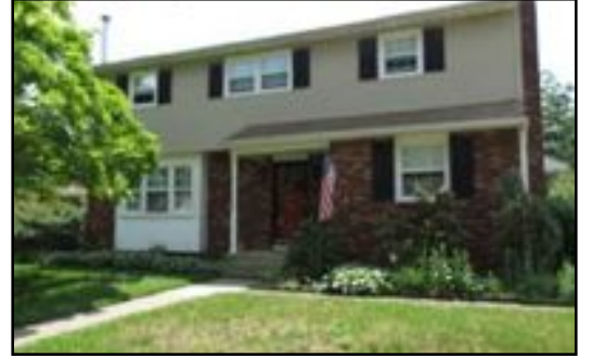
200 Madison Avenue Barrington/Gardens $259,900