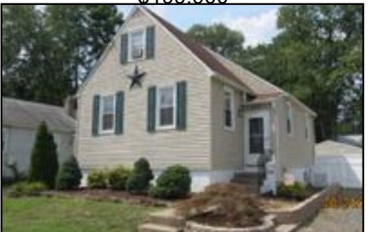
317 Haines Avenue Barrington $218,900