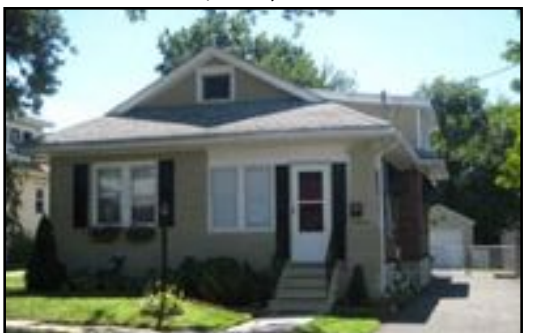
2022 W. High Street Haddon Heights $199,900