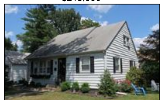
1357 Maple Avenue Haddon Heights $248,900