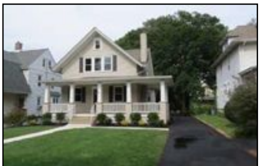
213 10th Avenue Haddon Heights $369,900