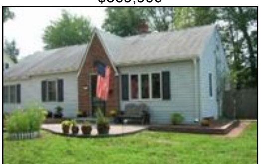
1518 Maple Avenue Haddon Heights $249,900