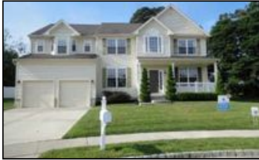
6 Ashley Court Barrington/Hidden Ponds $389,900