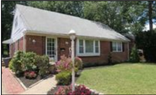
1016 Chesterfield Road Barrington/Tavistock Hills $248,000