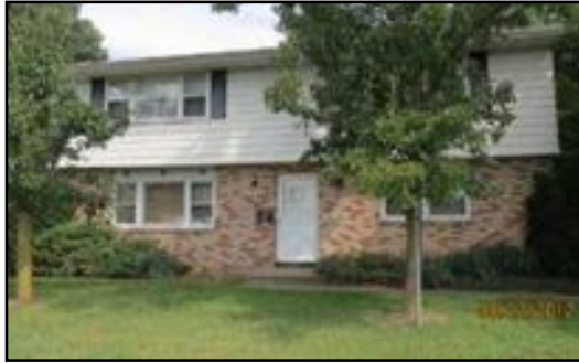
61 E. Gloucester Pike (Duplex) Barrington $184,900