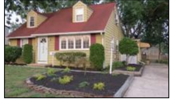
218 Adams Avenue Barrington/Gardens $209,900