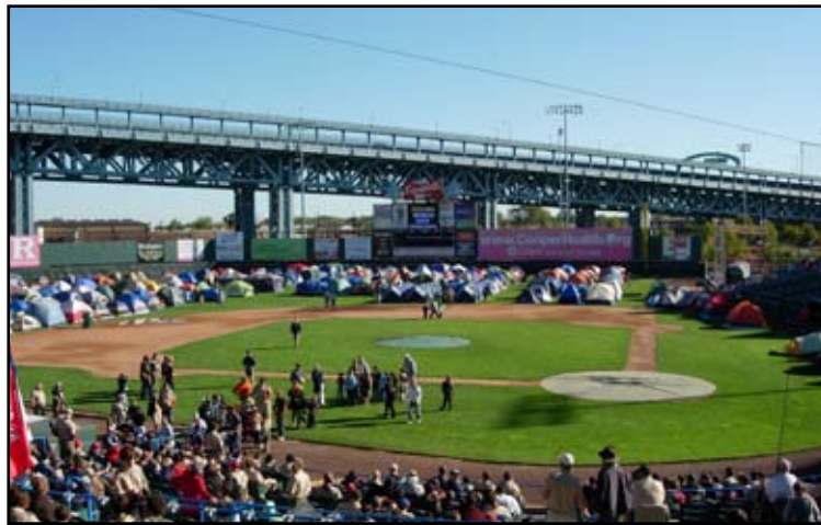
Scouts camping at Campbell's Field

At the meetings, they will learn the basics of Cub Scouting and citizenship while creating arts & crafts. As in all good Cub Packs, each Cub will have the chance to create a Pine Wood Derby car out of a block of wood, and compete in a pack race. The Cubs and their families will camp out together a couple of times a year and take local adventure and historical trips. Already, they took on the NJ Lighthouse Challenge, visiting every NJ lighthouse and sleeping over night at the one in Absecon. Progress in their Scouting journey will be noted by badges and awards. During the summer, they also