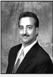
Joseph Bozza Real Estate Assoc.