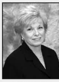
Pat Driscoll Real Estate Assoc.