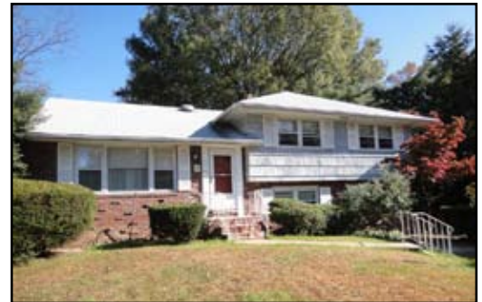
1201 Chesterfield Road Barrington/Tavistock Hills $159,900