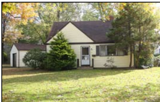
521 5th Avenue Barrington/Gardens $149,900