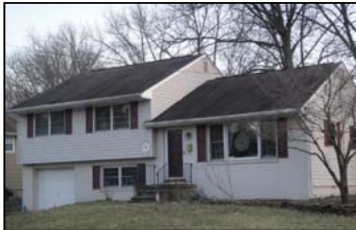
1200 Oakwood Road Barrington/Tavistock Hills $209,900