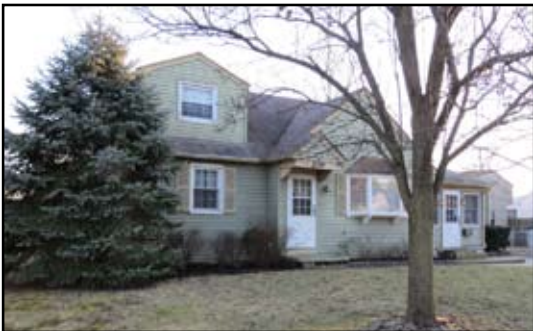
200 West Gloucester Pike Barrington/Gardens $149,900