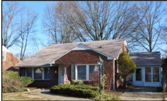
1025 Chesterfield Drive Barrington/Tavistock Hills $198,900