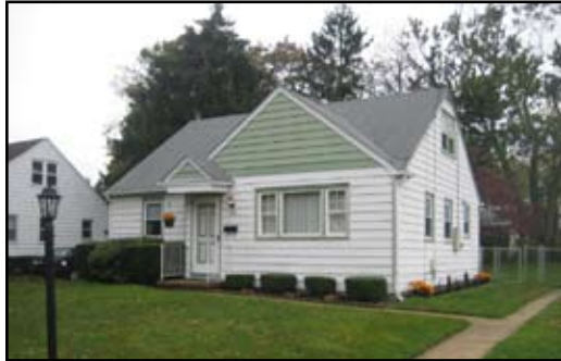
137 Russell Avenue Barrington/Gardens $146,900