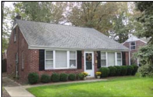
1220 Mercer Drive Barrington/Tavistock Hills $192,000