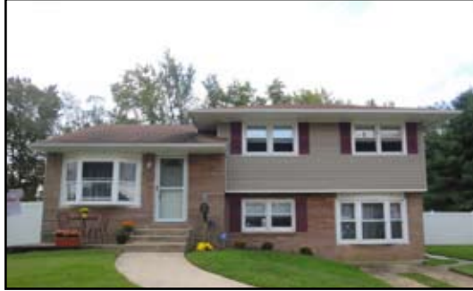
251 Lott Avenue Barrington/Gardens $196,000