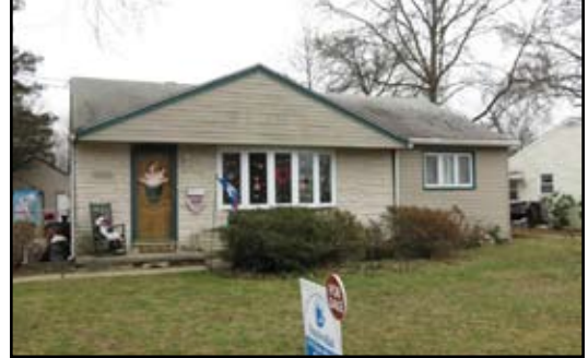
150 West Gloucester Pike Barrington/Gardens $149,900