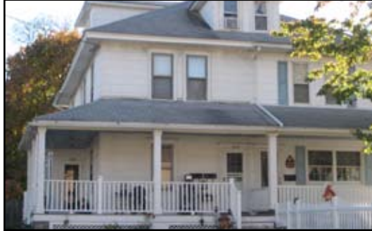
412 Clements Bridge Road Barrington/Duplex $135,000