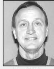
Paul Whitman Real Estate Assoc.