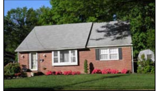
1016 Chesterfield Road Barrington/Tavistock Hills $248,000