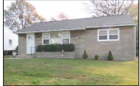
206 Willmont Avenue Barrington/Gardens $139,000