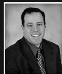
Robert Hughes Real Estate Assoc.