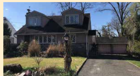
316 Hutchinson Avenue