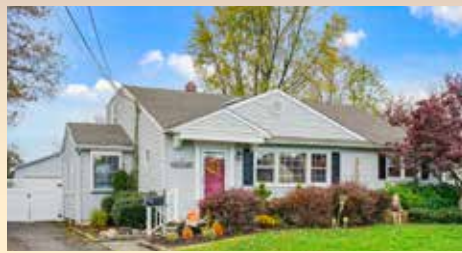
215 Edwards Avenue $219,900