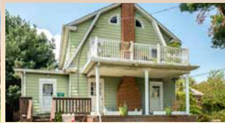
213 Clements Bridge Road $179,900