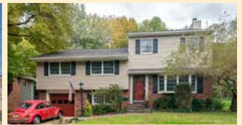
1224 Chesterfield Road