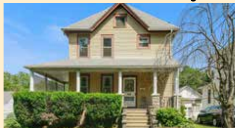
205 Albany Avenue