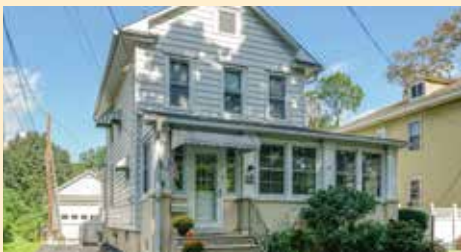
203 Albany Avenue