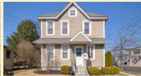
203 Clements Bridge Road