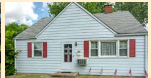
153 W. Gloucester Pike