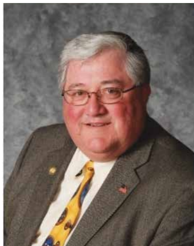
Mayor Robert Klaus