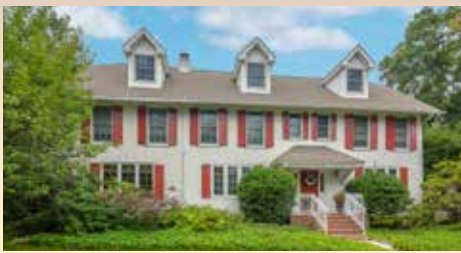
612 Warwick Road $675,000