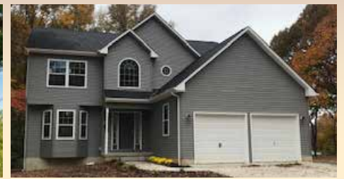
212 Courtney Drive $399,900