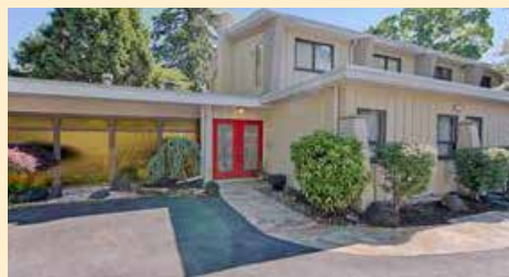
904 Warwick Road