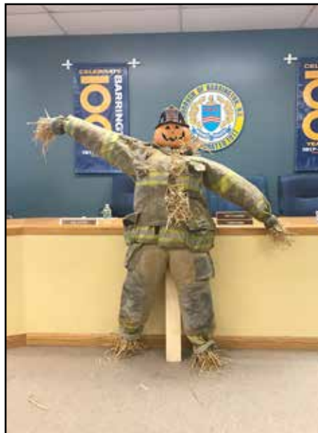
Scarecrow Contest! See page 16