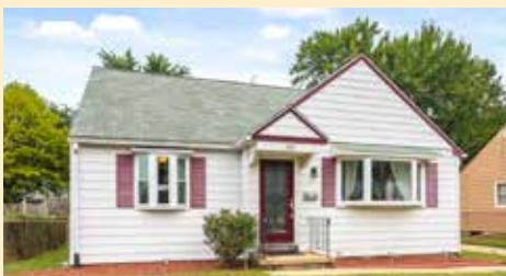
205 Russell Avenue