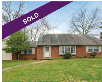
396 Tavistock Blvd. Barrington $188,000