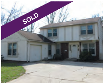
230 S. Nassau Drive Barrington $150,000