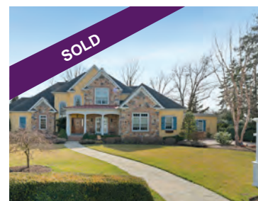
40 Oak Avenue** Barrington $875,000