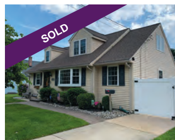
513 Thomas Avenue** Barrington $236,900