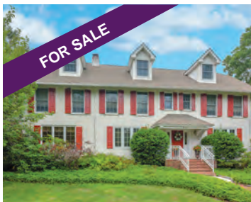
612 Warwick Road Barrington $599,000