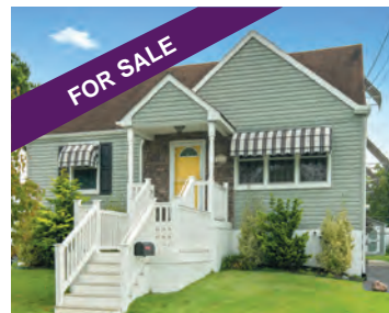
912 Lenton Avenue Barrington $204,900