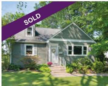
523 Charles Avenue** Barrington $175,000