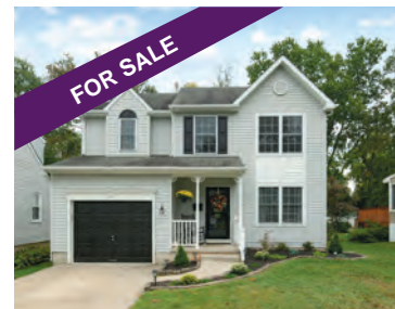
314 Reading Avenue Barrington $284,900