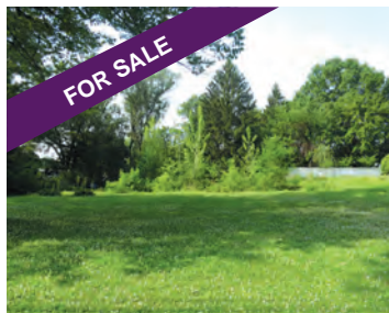
6 Hutchinson Ave Barrington $265,000