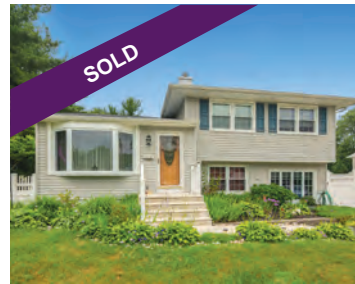
10 Timber Drive Barrington $199,000