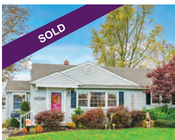
215 Edwards Ave Barrington $215,000