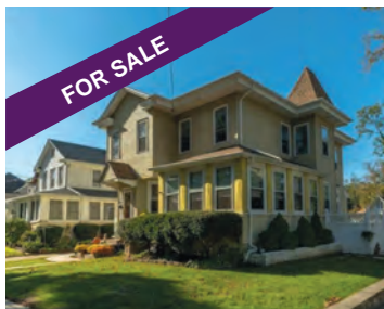
201 Albany Avenue Barrington $239,900