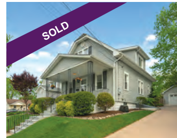
402 Austin Avenue Barrington $215,000