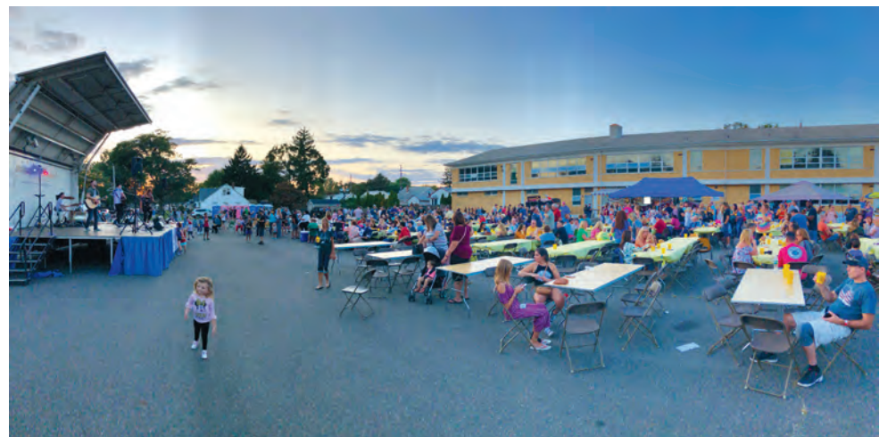
Brews, Beats & Eats Festival