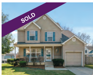
108 E. Williams Ave Barrington $287,000