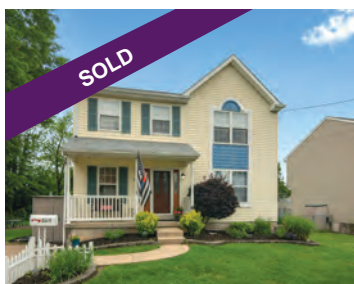
329 Trenton Avenue Barrington $230,000