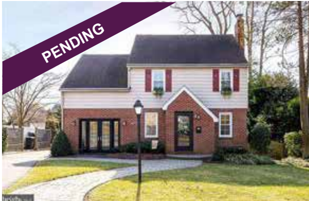
430 Princeton Road $444,900 Barrington

KathyMcRealtor@comcast.net | 609-519-6418 | 856-428-2600