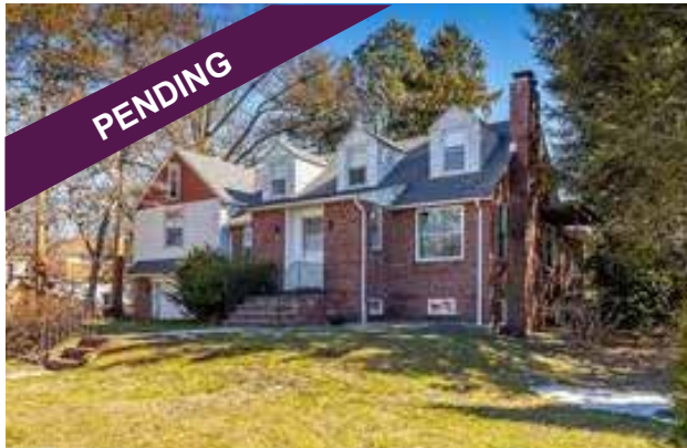
232 Highland Avenue $301,100 Barrington