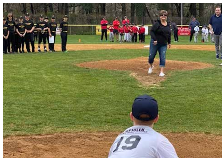
Mayor throws out first pitch at Little League opener