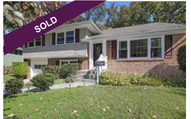
1221 Oakwood Road $300,050 Barrington