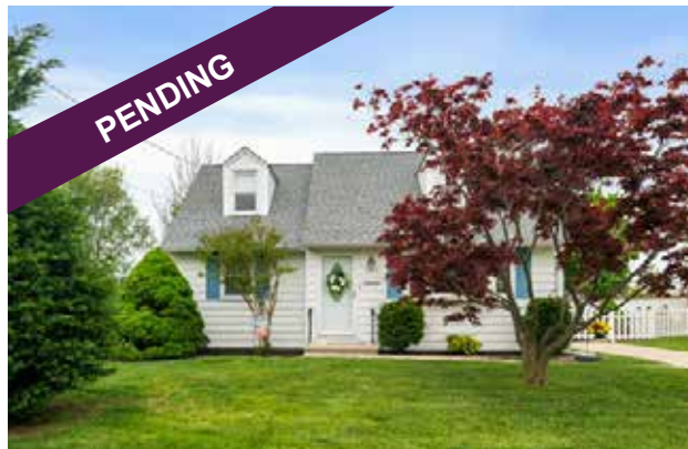
209 Adams Ave $219,900 Barrington