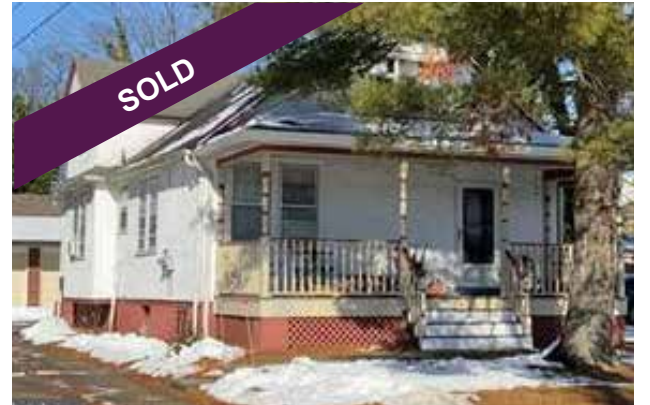
15 W. Gloucester Pike $200,000 Barrington