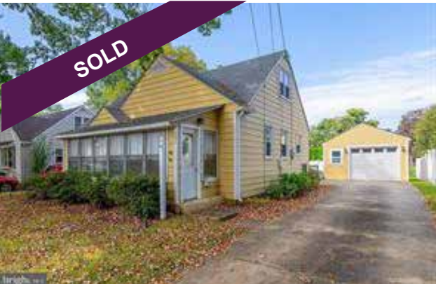
307 W. 4th Avenue $192,000 Barrington