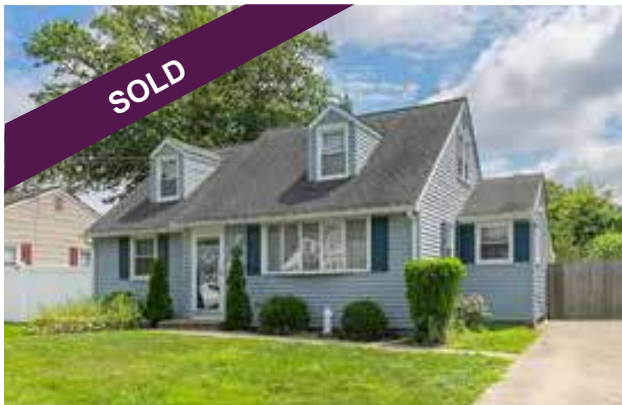
208 Russell Avenue Barrington $190,000