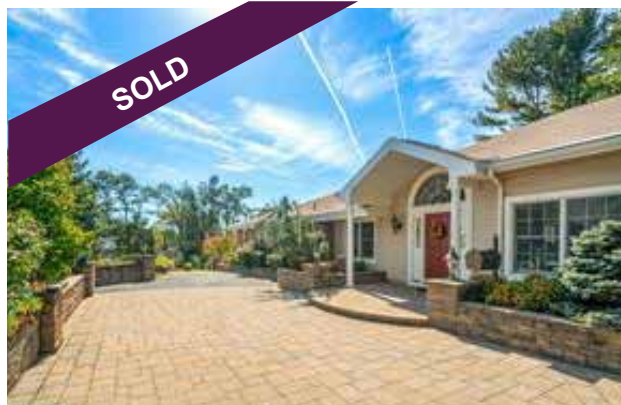
315 Hutchinson Avenue $449,900 Barrington