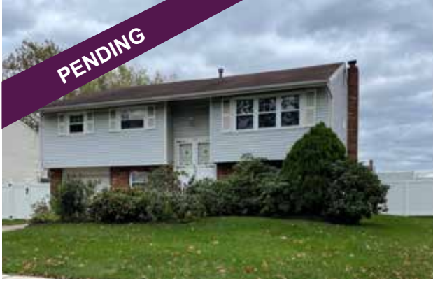
221 Russell Avenue