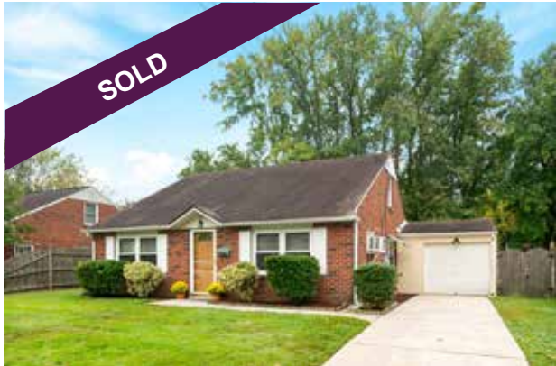
906 Davis Road $405,000