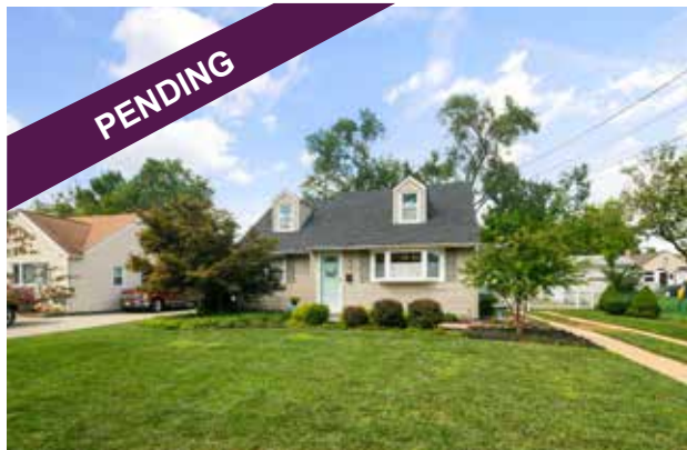
203 Madison Avenue