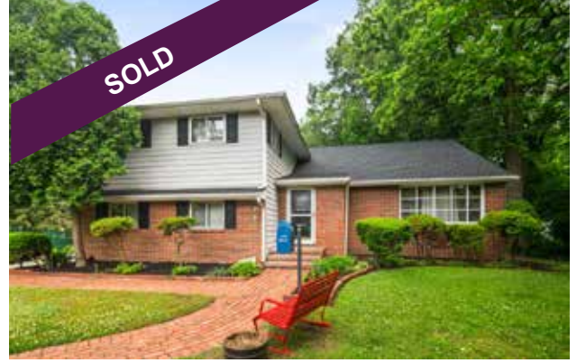
15 W. Gloucester Pike $200,000