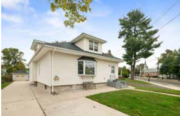
219 Trenton Avenue, Barrington $279,900