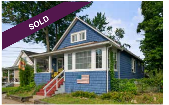
425 Clements Bridge Road $150,000