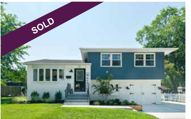
37 Enders Drive $350,000