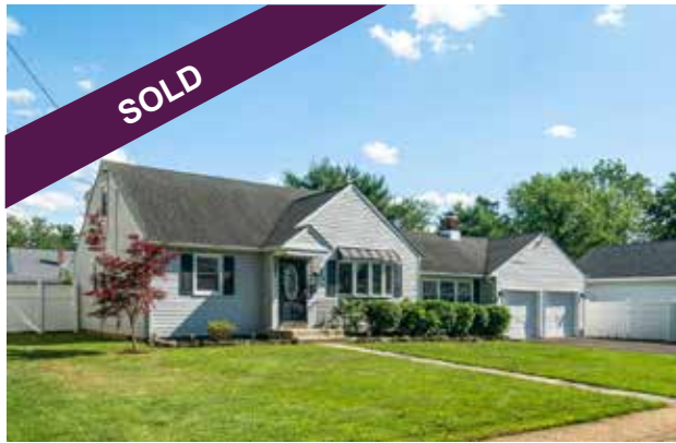
304 W. 1st Avenue $305,000