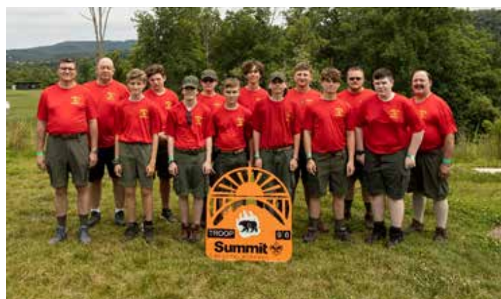
2021 - Troop traveled to the Summit Bechtel Reserve in West Virginia for a full week of Camp

For any boys of ages 11-17 that may be interested in camping adventures, learning new skills and having fun the Troop meets on Sunday Evenings at the Barrington Recreation Center from 7:00pm – 8:30pm. If you would like more information about joining please visit www.BeAScout.org .