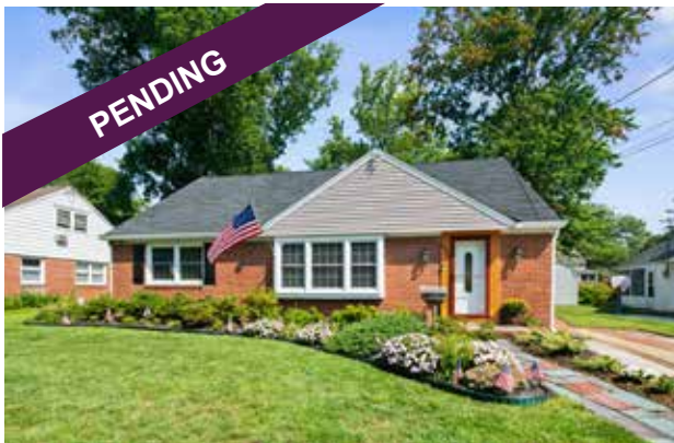
1009 Wayne Road