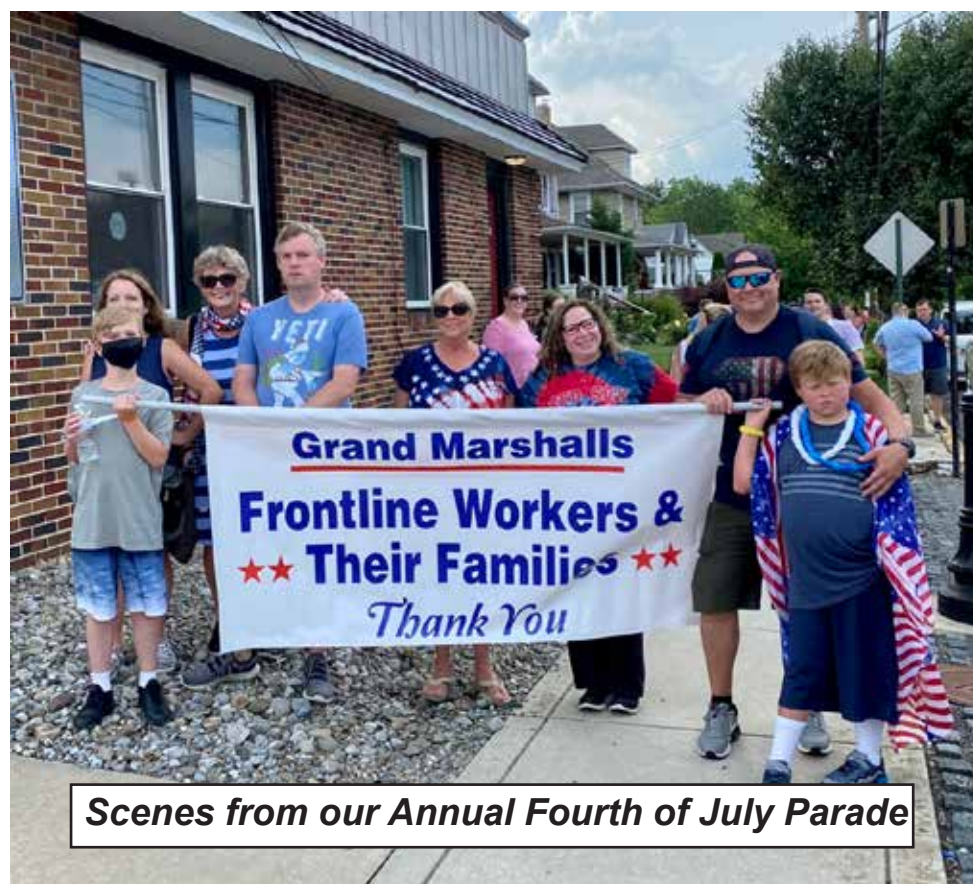
Scenes from our Annual Fourth of July Parade